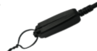
III. Insert the pulling cable through the Pulling Tool ring.