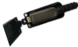
I. Place the Micro HDMI connector inside the Pulling Tool.