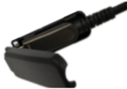
II. Close the Pulling Tool cover.