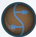
True balanced power cable