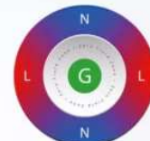
Ground Zero design by iFi