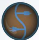
True balanced power cable