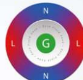
Ground zero design by iFi