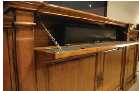
70052 Pull Down Media Compartment