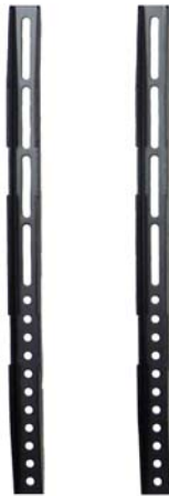
TV Mounting Brackets