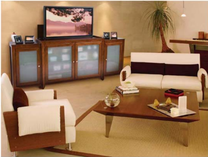
Living Room Full Size 55" TV Lift Cabinets