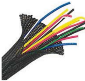
Cable Management System