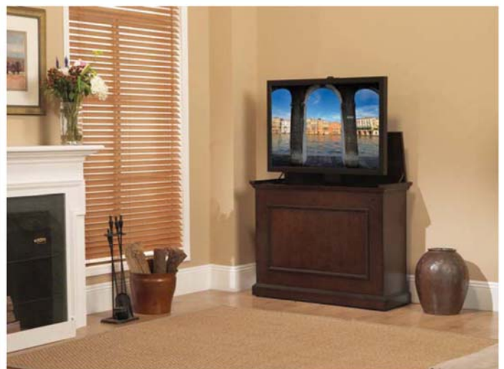
Any Room Universal TV Lift Cabinet