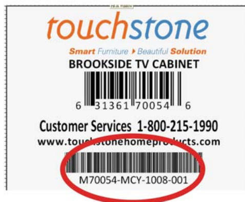
Cabinet Serial Number