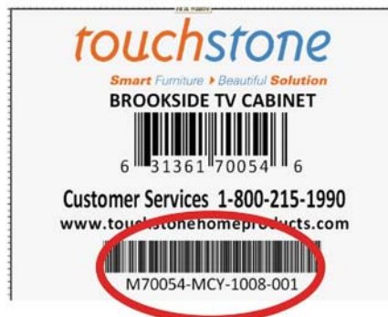
Cabinet Serial Number

Prior to registering, make note of your cabinet serial number which can be found on the 3x3 white rectangular label affixed prominently on the inside of the cabinet under the lid. The bottom line set of numbers on this label is the cabinet serial number.