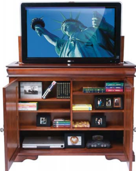
Full & Mid Size Main Cabinet Interior