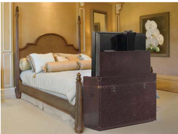
Bedroom End of Bed TV Lift Cabinets