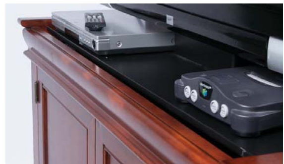
End of Bed Cabinet Component Shelf