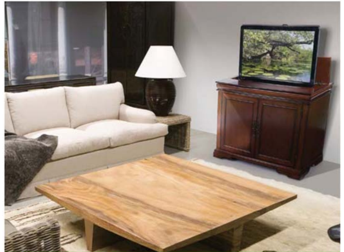
Family Room Mid Size 45" TV Lift Cabinets