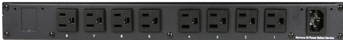
SPD-0815 rear view