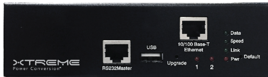
SPD-0215 front view