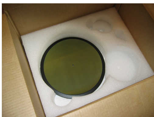
Unpacking: platter Fig 5.