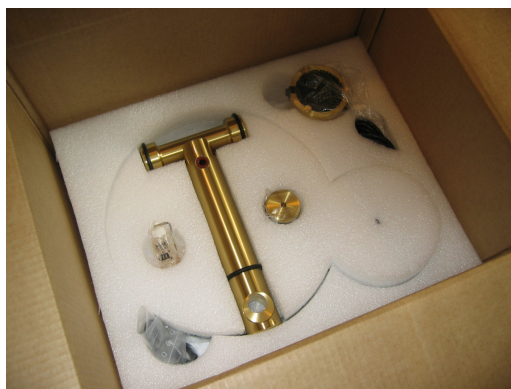
Unpacking: T base and parts Fig 3.