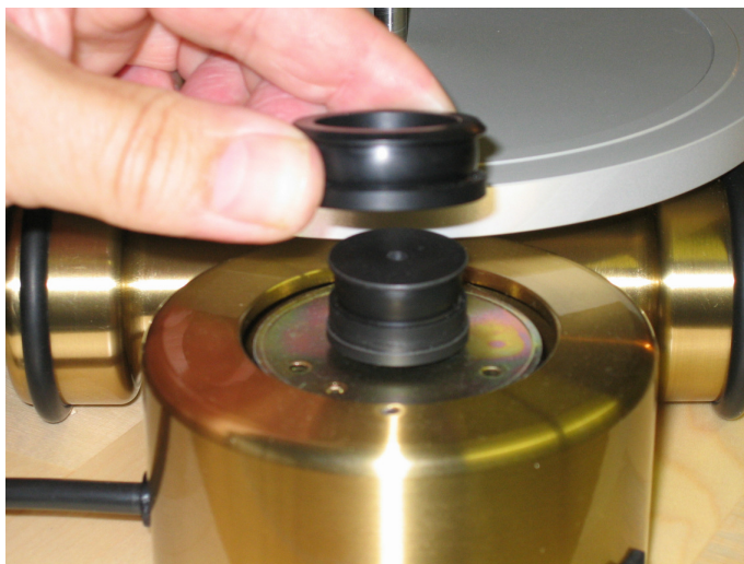
45 rpm crown ring adaptor Fig. 8.

The pulley fitted is for 33 rpm. Find the black plastic crown pulley ring which fits over the existing motor pulley increasing the diameter of the motor pulley and bringing the speed up to 45 rpm. To do this the platter must first be removed and, with clean fingers, stretch the belt away from the motor pulley while, with the other hand, pushing down crown pulley ring. Make sure the thicker ridge goes down. See fig. 8. Return platter. To remove the crown pulley reverse the procedure.