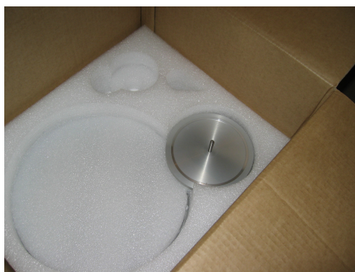
Unpacking: subplatter Fig 4.