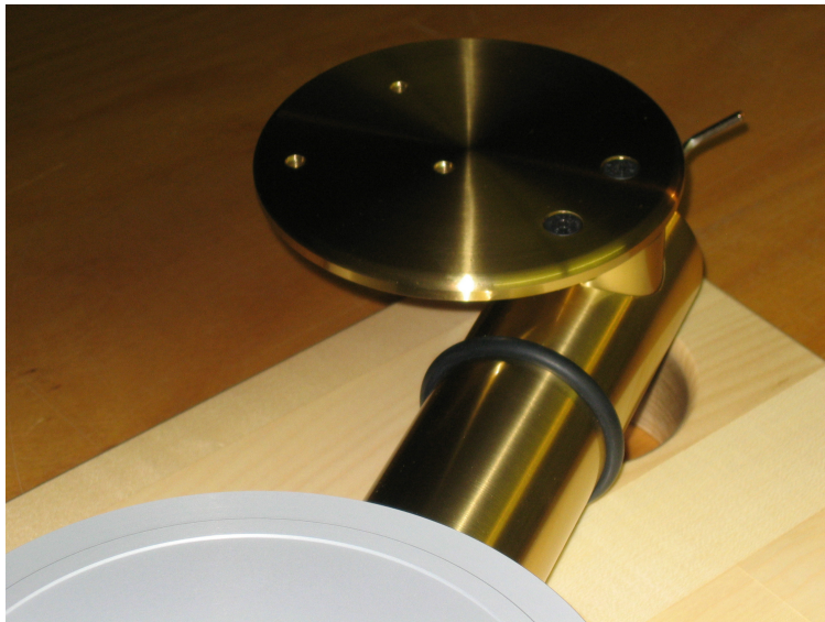
Circular brass armbase Fig 7.

Remove the brass pillar and find underneath two threaded holes. Find the circular brass arm base (optional) with appropriate cut-out. Using Allen key (3 mm) and two screws fit this onto the pillar. Insert back into T base and, with tonearm protractor, position the brass plate correctly by rotating the brass pillar while releasing the VTA screw with Allen key (3mm). See fig. 7. Follow tonearm mounting instructions. It is possible that in some circumstances the lid provided may not fit.