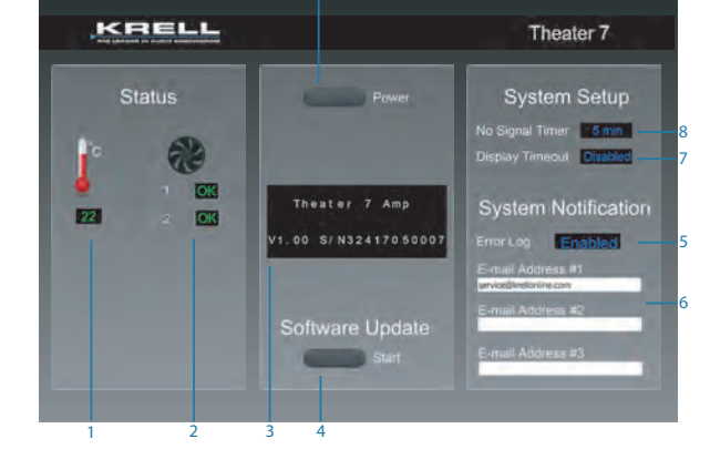
Figure 2 Network Control Screen

After connecting the Theater 7 amplifier to a local area network (LAN) via the RJ 45 connector (17), enter the amplifier's IP address into the address bar of a web browser on a device connected to the same LAN. The following additional features are now available.