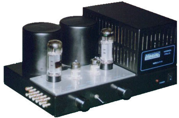
The first amplifier (1994)

Our attention to detail will guarantee years and years of trouble free listening.